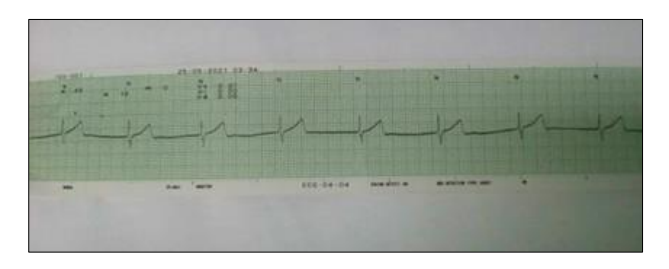
Figure 3 EKG. Complete A-V lock

There were no complications during the surgical act and in the immediate postoperative period it evolved without major difficulties. Already in the PICU, he underwent treatment with captopril, aldactone and a diuretic pump. It was possible to separate from mechanical ventilation at 24 hours of It immediately evolved without major difficulties. Already in the PICU, he underwent treatment with captopril, aldactone and a diuretic pump. It was possible to separate from mechanical ventilation at 24 hours of It immediately evolved without major difficulties. Already in the PICU, he underwent treatment with captopril, aldactone and a diuretic pump. It was possible to separate from mechanical ventilation at 24 hours of operated with adequate tolerance and without risk of failure at weaning, with SO2> 97%. On the third postoperative day, he presented a rhythm disorder (Fig. 3) (bradycardia with complete atrioventricular block) that required placement of an external pacemaker, this complication is frequent in this type of surgery, secondary to atrial.