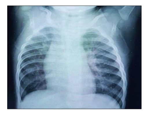
Figure 1 AP chest X-ray. Bilateral inflammatory lesions are seen

Hemoglobin: 17g / dl Hematocrit: 0.54 Leukocytes: 15x109 / l Segmented: 14% Lymphocytes: 84% Platelet count: 302 x10 9 / l Creatinine: 67 mmol / l Glycemia: 7.3mmol / l, D-dimer positive, with slight metabolic and lactic acidosis 5.1mmol / l. Chest radiograph with evidence of bilateral inflammatory-looking lesions. (Fig. 1)